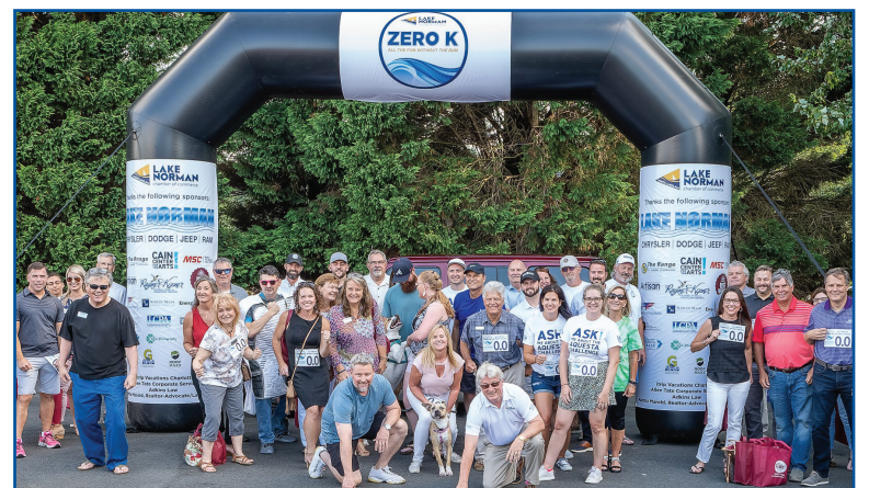
2021 Zero K Participants

On Friday, June 24th we will host our Third Annual Zero K. Held at Lost Worlds Brewery, we have moved it to a Friday afternoon to